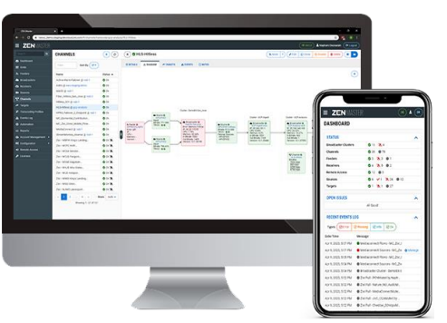
Zixi's ZEN Master UI

ZEN Master , Zixi's virtual control plane, allows users to securely orchestrate, manage and monitor broadcast quality, low latency live video workflows from anywhere in the world. Providing full telemetry of streams, ZEN Master offers essential tools like workflow visualization, alerting, history, automation, scheduling, reporting, and root cause analysis across complex media supply chains